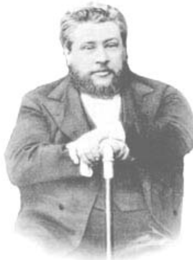
Charles Haddon Spurgeon 1834 - 1892